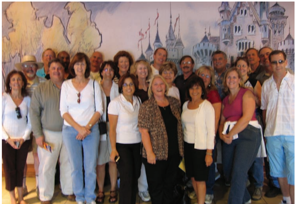
Pictured above are the participants who attended the CSMFO Board retreat.

City of Merced, Finance Officer 2007 CSMFO President