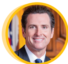
Lt. Gov. Gavin Newsom