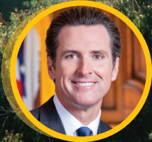
Lt. Gov. Gavin Newsom

SEPTEMBER 25-27, 2013 JW MARRIOTT LOS ANGELES